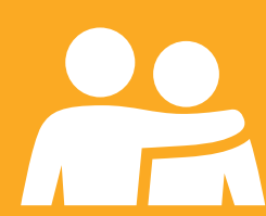
Other Community Services and Supports

HHUNY is the largest Health Home network in the region with connections throughout 22 New York State counties