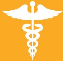
Coordinated Health Care